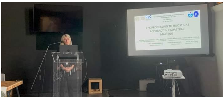
Prezentare în cadrul conferinței internaționale MMT 2023