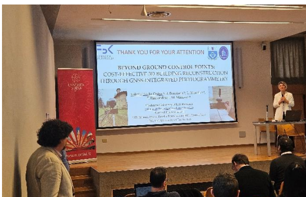
Prezentare în cadrul conferinței internaționale 3DARCH 2024