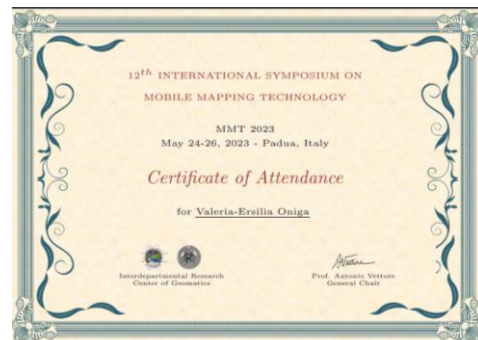
Certificat de participare la MMT 2023